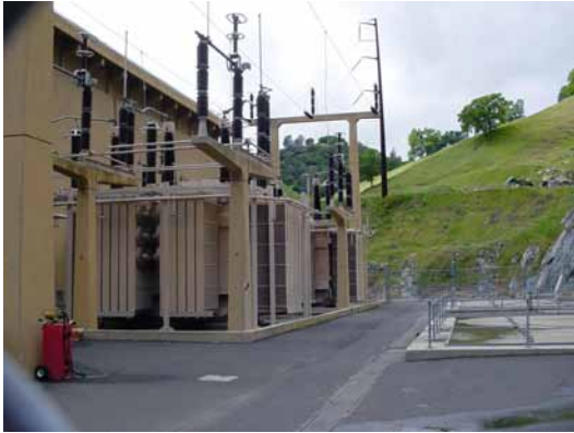
Figure 3—The hydroelectric power plant transformers are protected and monitored by SEL-387E Current Differential and Voltage Relays.

million kilowatt-hours of electricity. The power generated at this peaking plant supports the requirements of the nearby area, with remaining energy marketed through the grid to customers located outside the area.