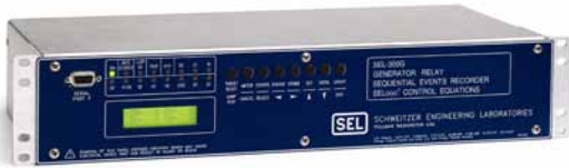
Figure 8—Generator protection is provided by two SEL-300G Relays, which also provide important metering and events reporting/recording capabilities plus thermal protection in conjunction with RTDs.

able locally and at the main control center located more than 60 miles away.