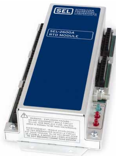
Figure 7—The SEL-2600A RTD Module used for ac power source measures up to 12 RTD temperatures plus one contact input. A fiber-optic link provides electrical noise immunity and ground isolation between devices. The SEL-2600D RTD Module is available for dc power sources.

The original SEL-2600 RTD Module was installed and tested. However, the RTD-connecting cables were not shielded, and the existing RTDs have a much lower signal-to-noise ratio tolerance; therefore, the module could not overcome the noise from the RTD wiring while the generator was under load.