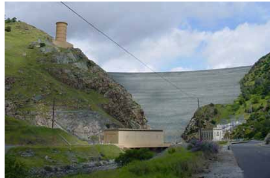
Figure 1—The dam is an earth-and-rock-fill structure, more than 600 feet high and 1,500 feet wide at the crest.

Hydropower, such as that produced at this project, provides stability to the power grid and helps avoid outages due to the loss of a base-load power plant. This reserve hydropower, which can be brought online within a few minutes, provides standby electric generation that keeps the power grid stable. Such plants help compensate for fluctuating power generation and transmission flows that occur during emergencies.