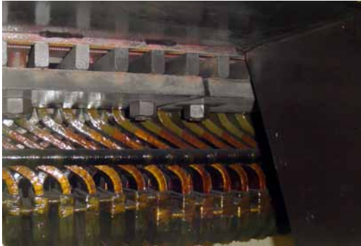
Figure 6—The hot spot was located at the endcaps of the generator stator winding, and the heat radiated toward the RTDs located above.

tion as to what was happening with that RTD. The customer considered changing the RTD being monitored by the existing relay, but decided, instead, to install the SEL technology, which can give alarms and tripping on all RTDs simultaneously,” Rauch explains.