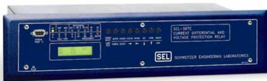
Figure 4—Two SEL-387E Relays are installed to provide comprehensive protection, metering, and event reporting of the power plant step-up transformers.

Major components of the upgrade project include two SEL-387E Relays installed for comprehensive protection, metering, and event reporting of the power plant transformers. Generator protection is provided by two SEL-300G Generator Relays, which also provide important metering and events reporting/recording capabilities plus thermal protection in conjunction with RTDs.