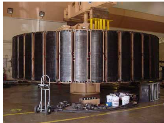
Figure 5—Shown is the 150 MW turbine hydrogenerator.

“The customer chose the SEL-2600A RTD Module because it requires no annual calibration or maintenance and resulting simplification of RTD wiring. A single fiber-optic interconnection between the SEL-2600A and SEL-300G Relay provides all needed temperature data for the alarm and protection capabilities within the SEL-300G Relay,” explains Greg Rauch, SEL application engineer.